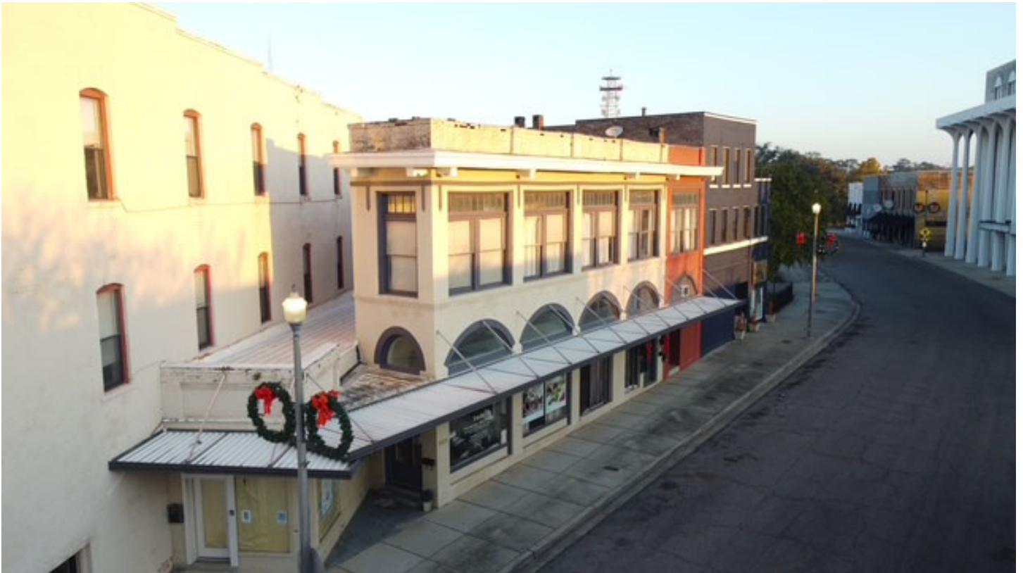
The Rasberry Building faces North Magnolia, one block west of Laurel Mercantile.