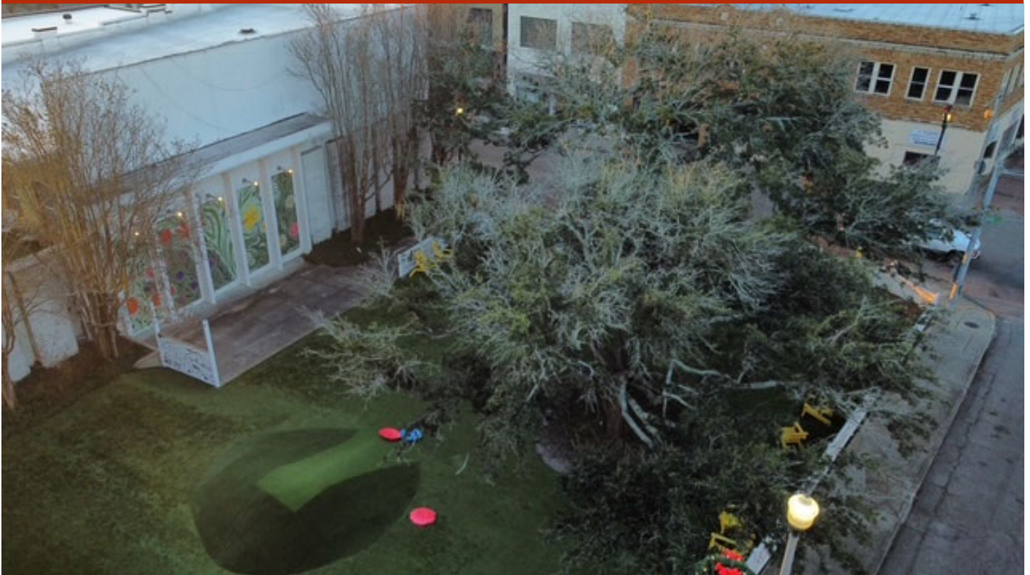
The Rasberry Building overlooks Trustmark Park, a popular live music venue.