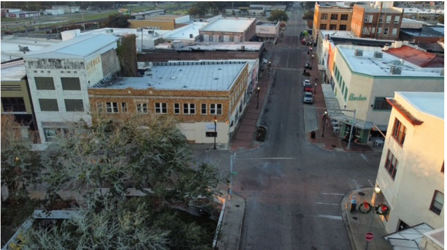
North Magnolia looking southward (Rasberry Building (right) Trustmark Park (left))