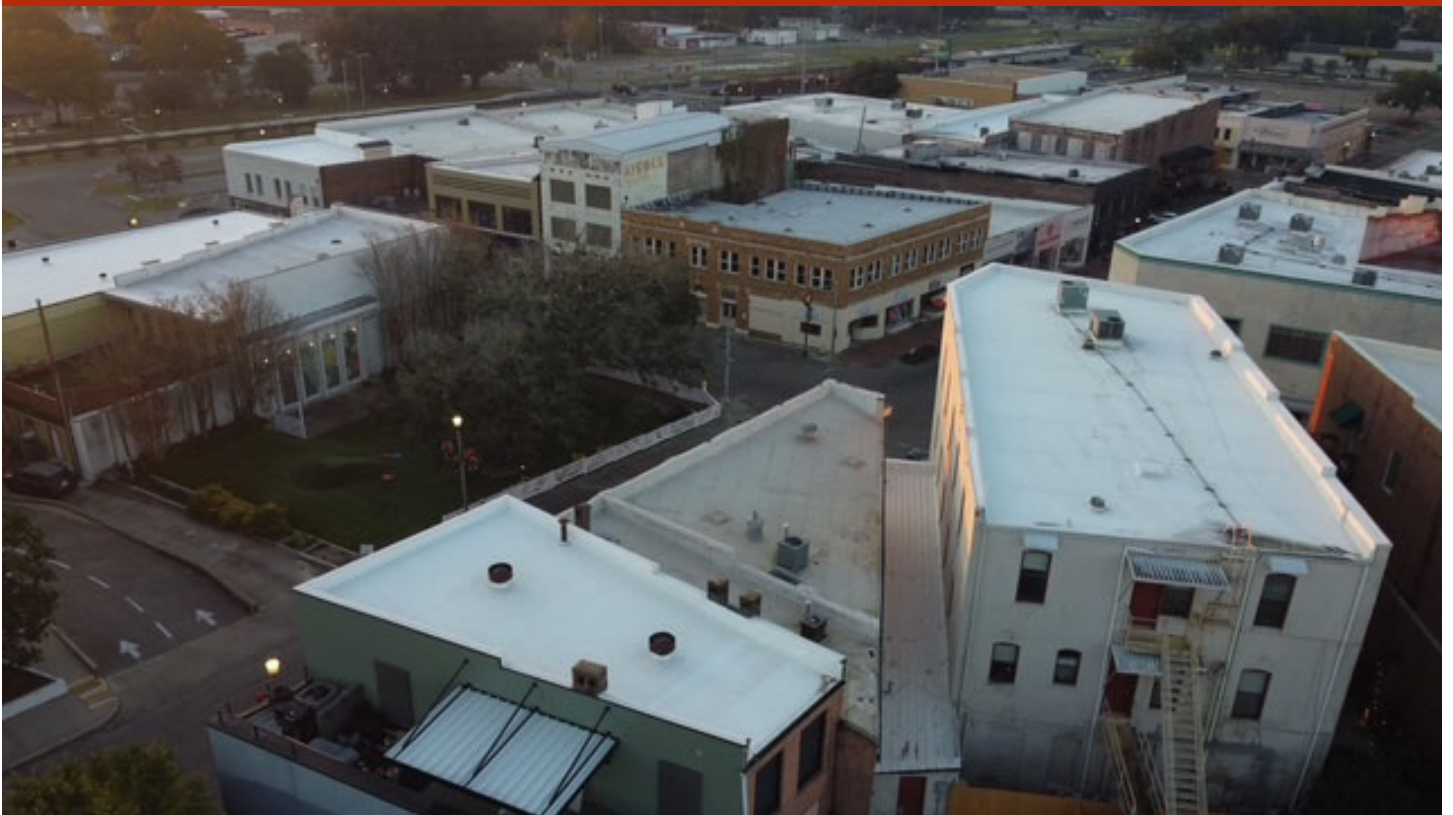
The Rasberry Building on North Magnolia, the most-traveled street in downtown Laurel.